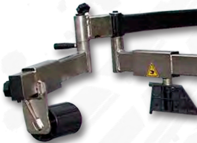
Table Top Clamping

Provides simple servicing of stiff sidewall tires and deep drop center rims. Dual bead press aids save time and offers flexibility in multiple mounting method.