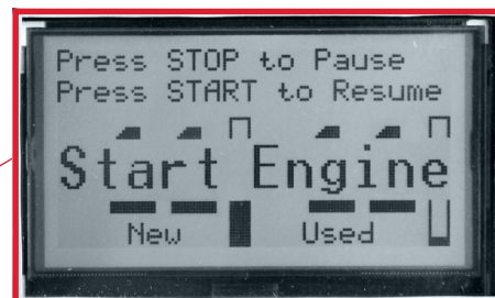
Easy to follow prompts