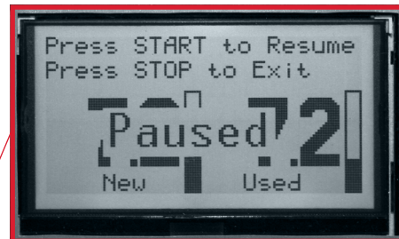
Ability to stop during service