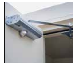
Hydraulic door closer