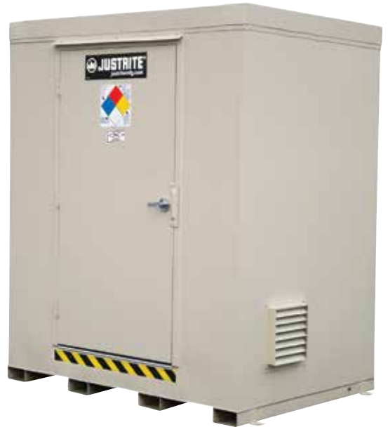
Model No. 912060 6-drum capacity