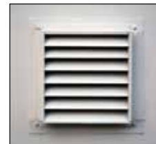
Vents with 90-minute fire damper