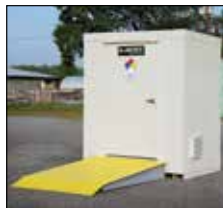
Locker with optional loading ramp

Designed to be placed near existing structures and/or property set-backs, 2-hour fire-rated lockers provide a safe yet convenient storage solution. This improved proximity over non-combustible models allows for more efficient use, distribution and storage of your flammables and combustibles. NOTE: Please check with your local authority having jurisdiction for set-back requirements and the correct wall/roof rating needed for your application.