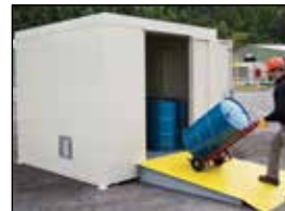
16-Drum No. 911160