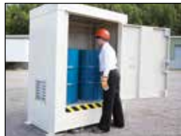
2-Drum No. 911020