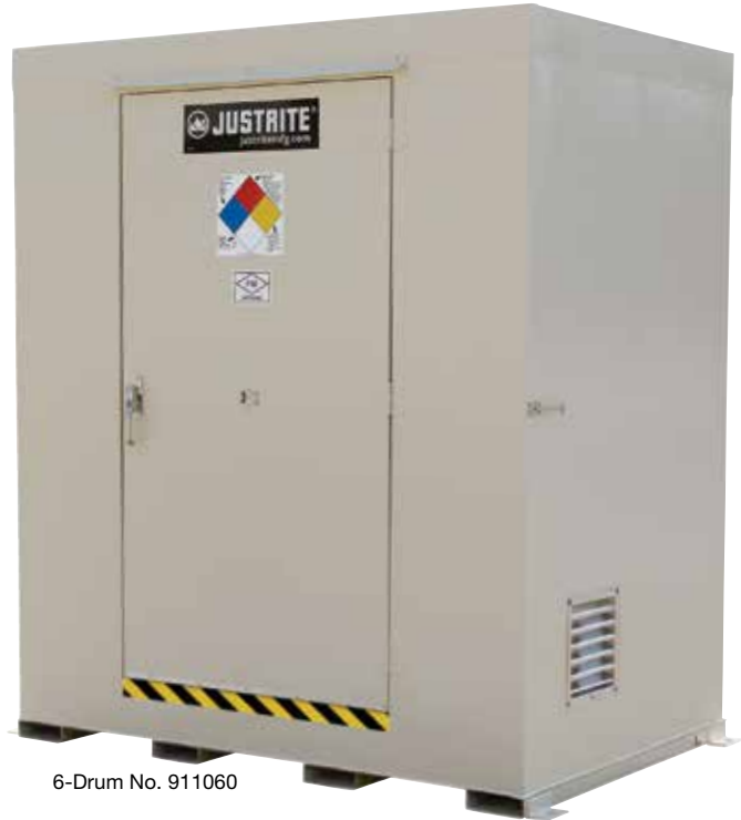
6-Drum No. 911060