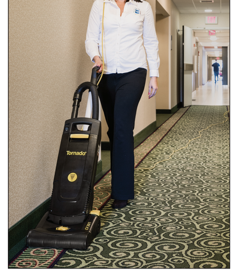
The CV vacuums are specifically designed for use in noise-sensitive environments.