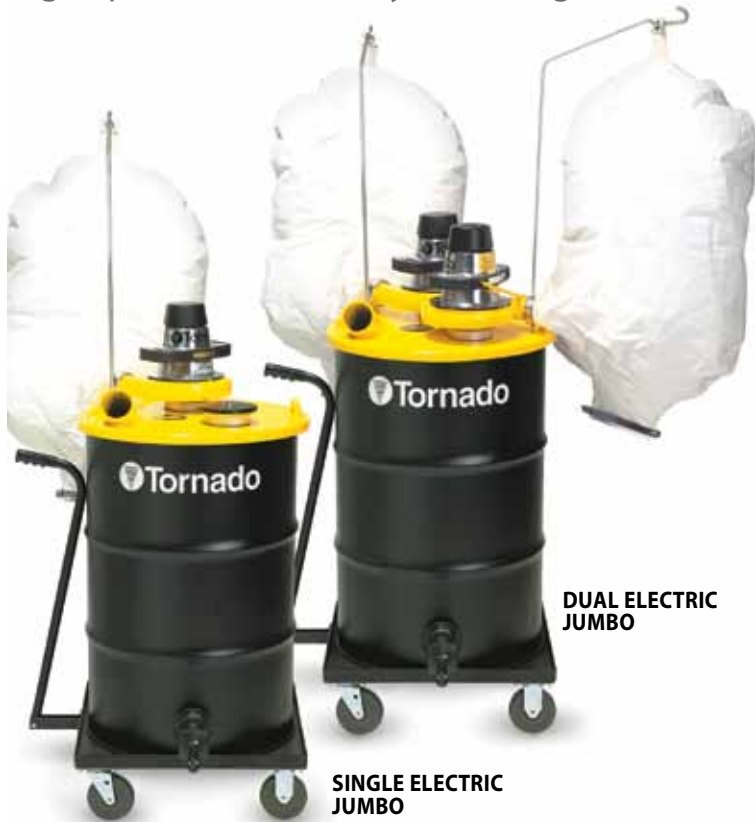
DUAL ELECTRIC JUMBO

High-speed bulk recovery, with 55-gallon steel drums for industrial applications